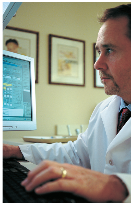
ADA Standards help provide interoperability in and efficiency in hardware and software for dentistry.

To purchase dental standards, please visit the ADA Store at adacatalog.org .